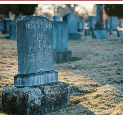
"Grave Looter" Revealed

Earlier this week, local authorities, newspapers and enthusiasts sounded the alarm. Unauthorized persons had allegedly entered the famous Viking grave field at Vang in Oppdal and drilled deep holes in 17 of the Viking graves. Several feared the worst on behalf of the grassy national treasure in Sør-Trøndelag; grave looting.