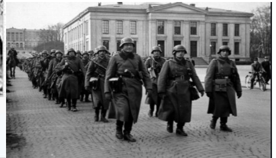
German soldiers marching through Oslo on 9 April 1940.