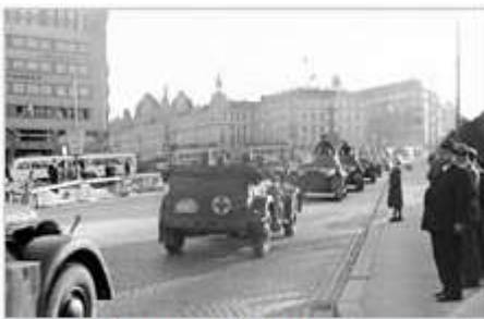
German troops enter Oslo, May 1940. In the background is the Victoria Terrasse, which later became the headquarters of the Gestapo.