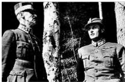
King Haakon and crown prince Olav seeking refuge as the German Luftwaffe bombs Molde, April 1940.