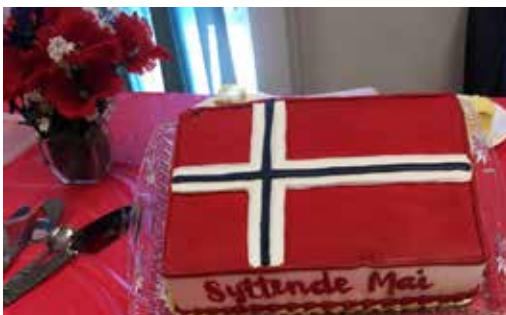
May 17 th Celebration