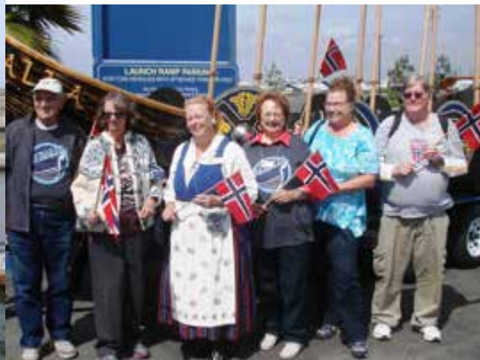
Marina High's launching of their Viking Ship – The Valhalla