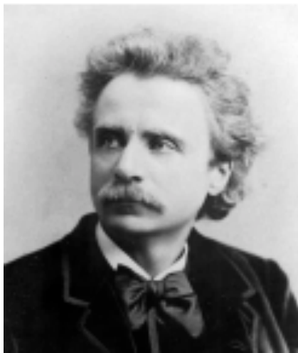
Celebrating Edvard Grieg