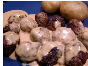
Norwegian Meatballs and Gravy